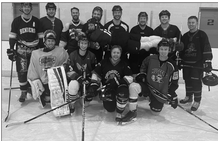
"C" Side Winners